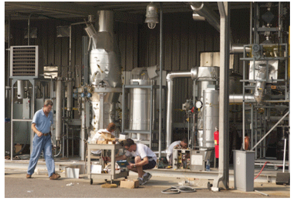
Bioconversion facility at University of Georgia.